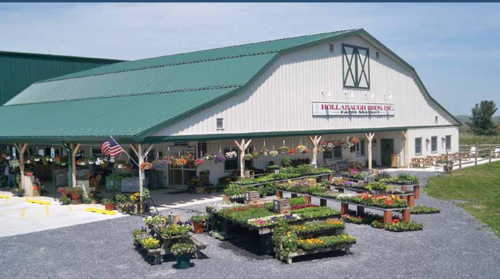
Hollabaugh Brothers Orchard ... page 10