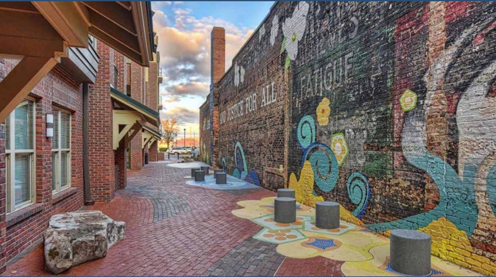
Downtown York Mural Walking Tour with York History Museum ... page 18