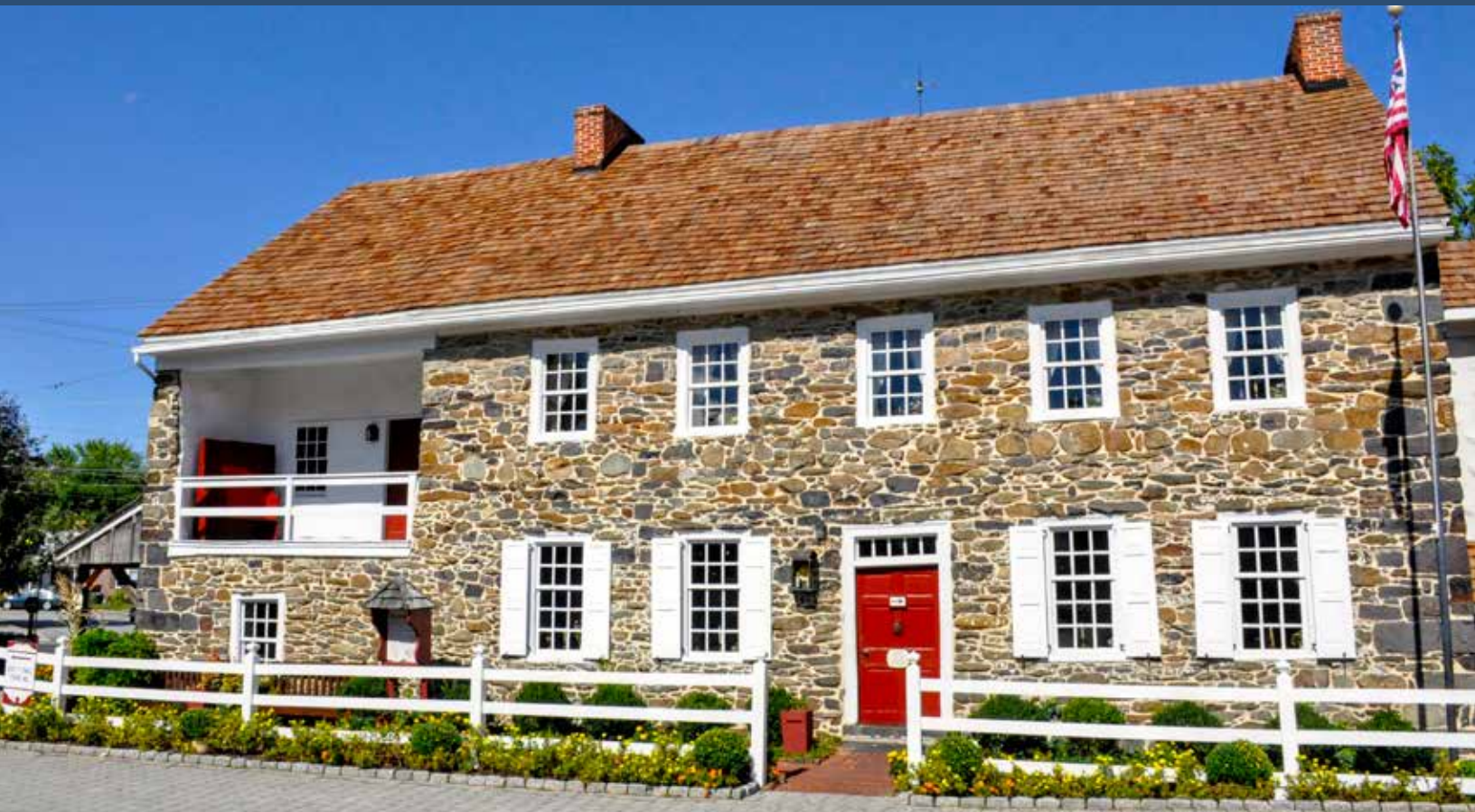
Dobbin House Tavern ... page 11